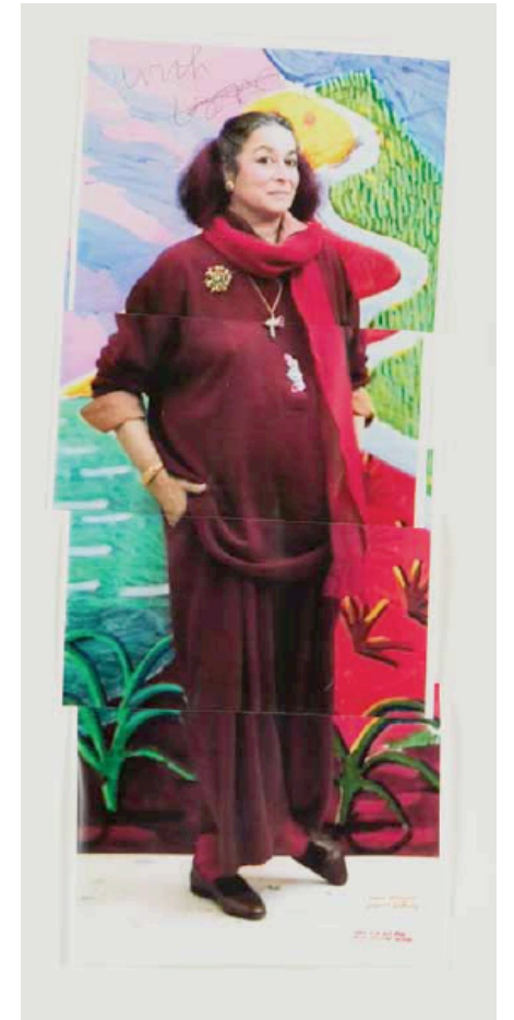
David Hockney, 1991