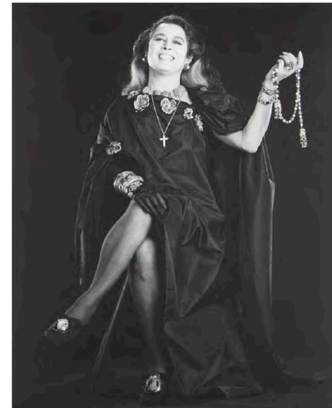
Robert Mapplethorpe, 1986