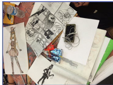
Student Art from a previous comic book design workshop

AM: Art in 3-D: Exploring Clay, Plaster, Wire, and More PM: Mixed Media