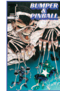
Nicolas Garza, Cover of Bumper & Pinball, Volume 2