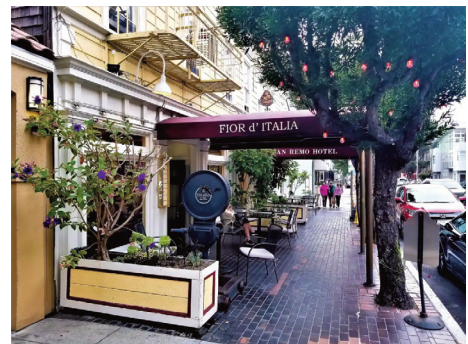
Fior d'Italia at the San Remo Hotel

Although Claude Monet visited Venice only once, his paintings of the city are among his most dazzling. This exhibition, co-organized with the Brooklyn Museum, is the first dedicated to Monet's Venetian cityscapes since their debut over a century ago. Featuring more than 100 artworks, the exhibition places Monet's Venice paintings alongside select works from across his career, including his Water Lilies , as well as Venetian views by artists such as Manet, Renoir, and Canaletto. Unlike the bustling scenes painted by other artists, Monet's Venice is eerily deserted, its architecture, buildings, and canals dissolving in an encompassing, hazy light he described as the envelope . This exhibition offers a rare opportunity to experience Monet's vision of the famed Italian city.